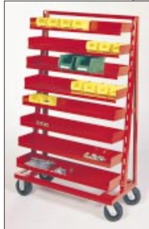
Single-sided A-frame with open- and close-lip trays.