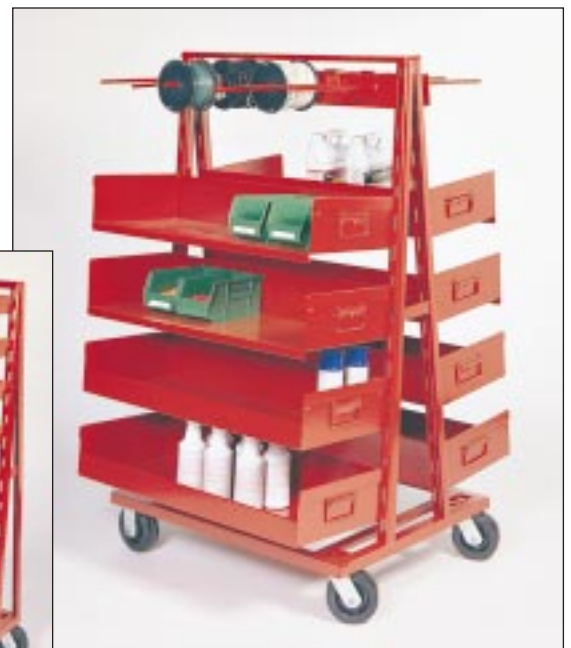
Double-sided A-frame with open- and close-lip trays and hanger bar with spindles.