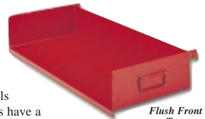
Flush Front Tray

Choose from either a 9" or 15" depth with an open or closed front. Closed front models have a 3" lip; open front models have a 1" reverse hem for added strength. 15" deep trays are not for use with the single sided version, model 1812.