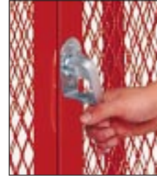
Lockable security handle.

An all-welded, heavy angle frame construction allows users to easily secure and transport heavy equipment, large boxed items and bulky materials. The totally enclosed see-through design and locking doors allow for optimal safety and security and superior ventilation.